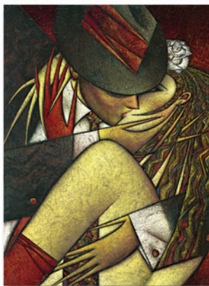
"Secret Service" 57" x 40"

"All great art started with a great line."