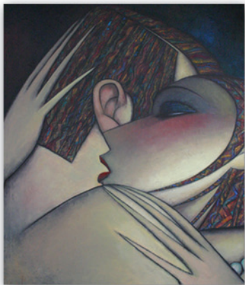
"Whisper" 39" x 34"