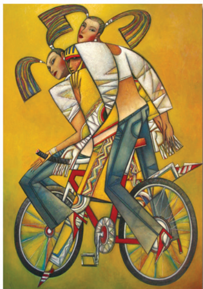
"Tour de Love" 72" x 50"

Artists for Breast Cancer Relief- Red Cross and Blue Shield Center Against Domestic Violence Donation