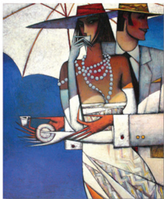
"Paradise Latte" 60" x 50"

7 North 6th Street Stroudsburg, PA 18360 Tel/Fax: 570-476-4407