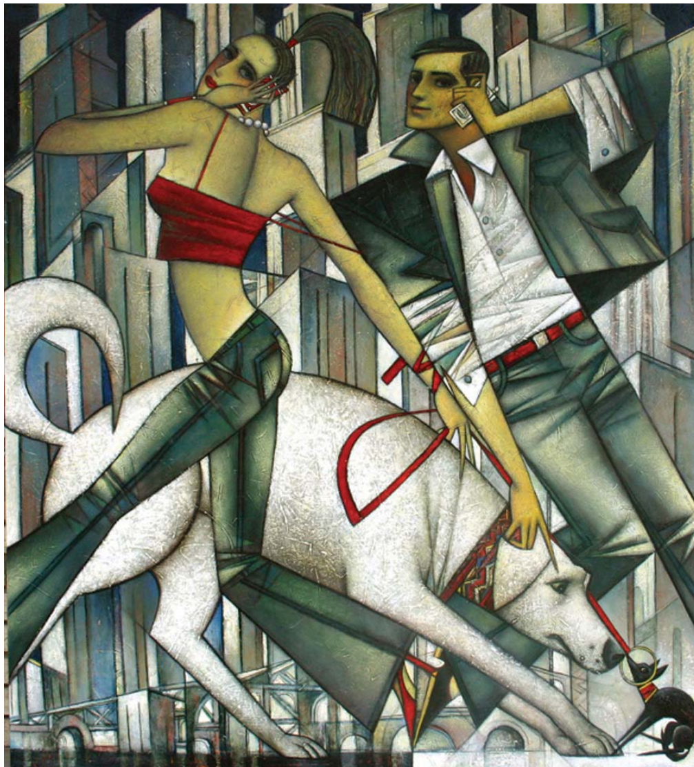
Walking and Talking