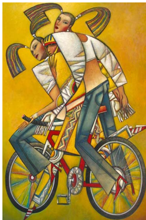
Tour de Love