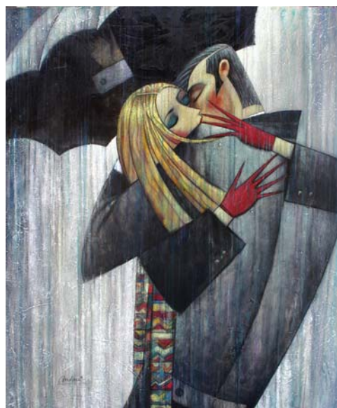
Amour sur Umbrelle